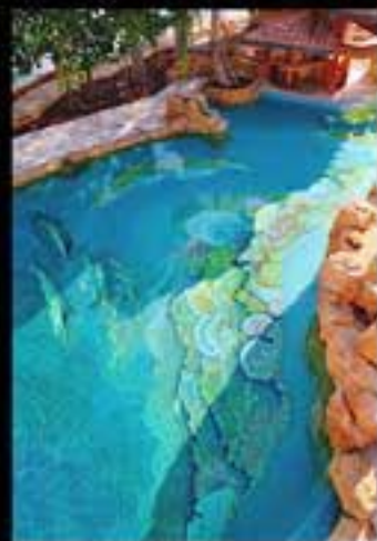
Fantasy Pool, USA