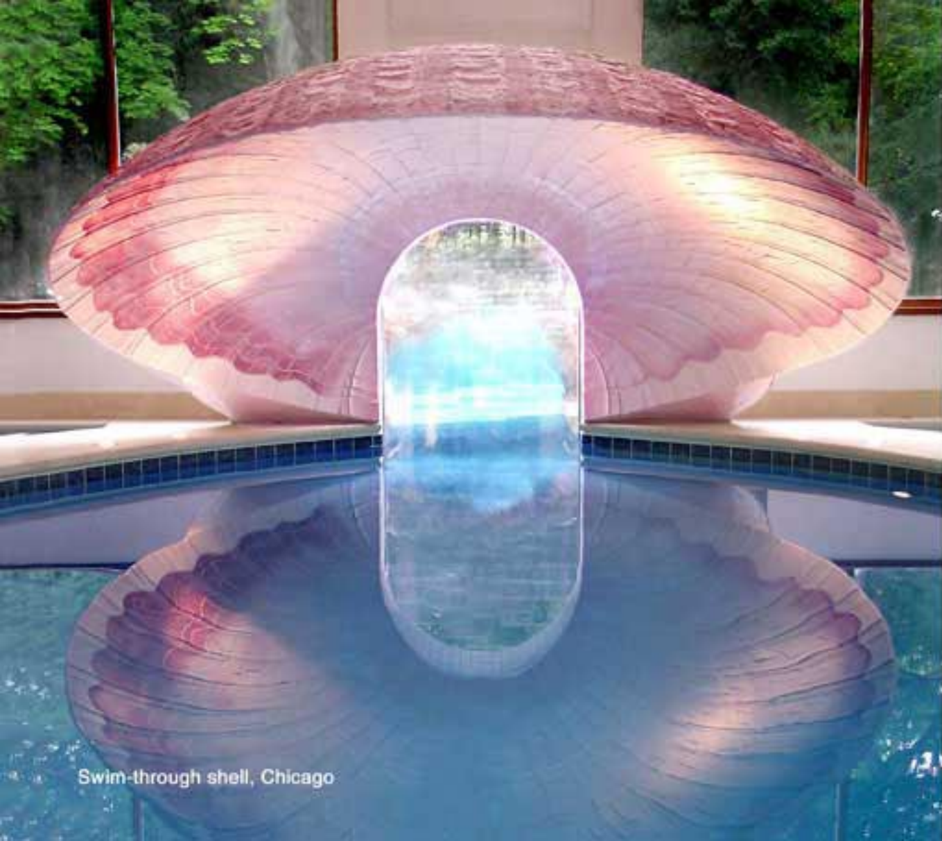
Swim-through shell, Chicago