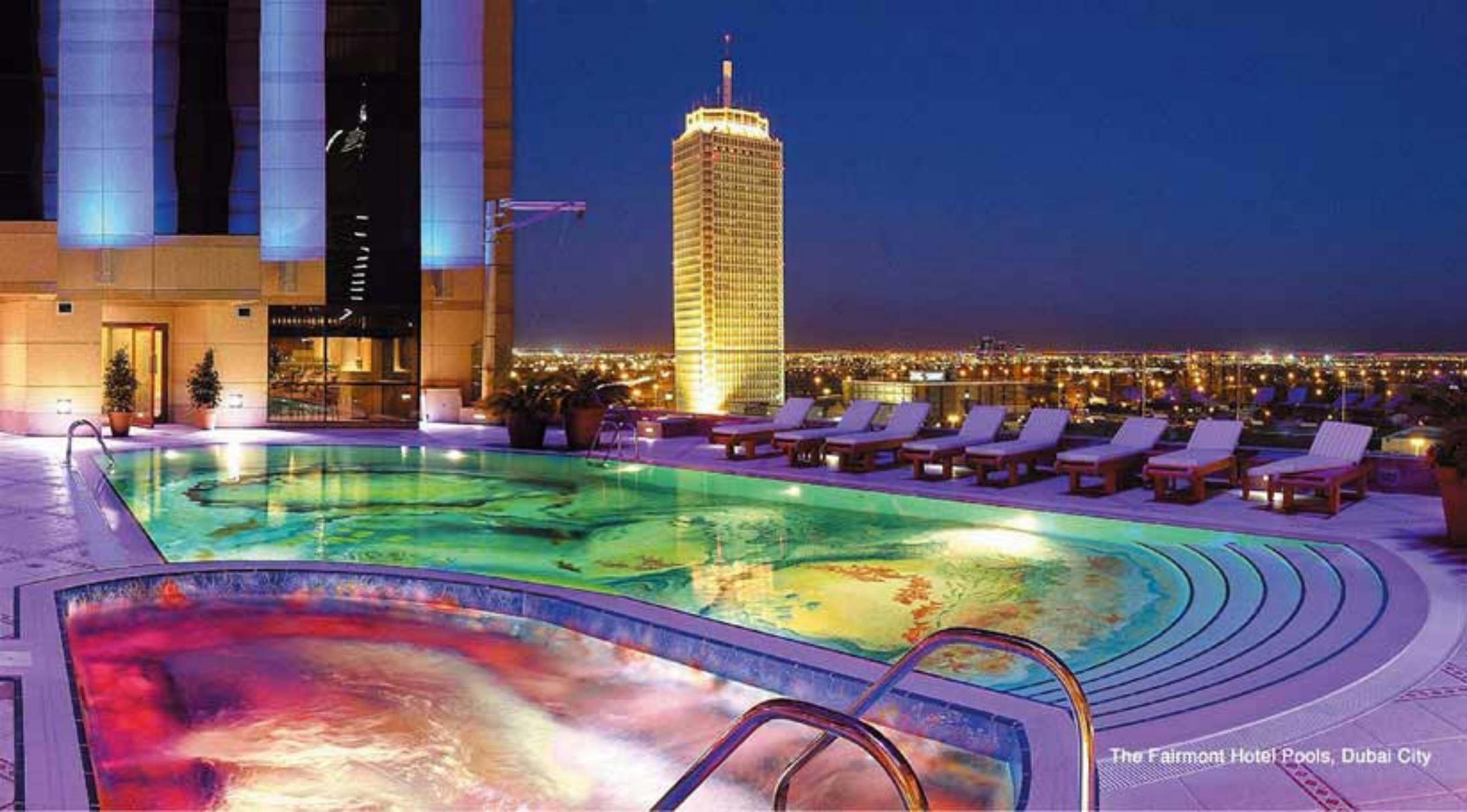
The Fairmont Hotel Pools, Dubai City