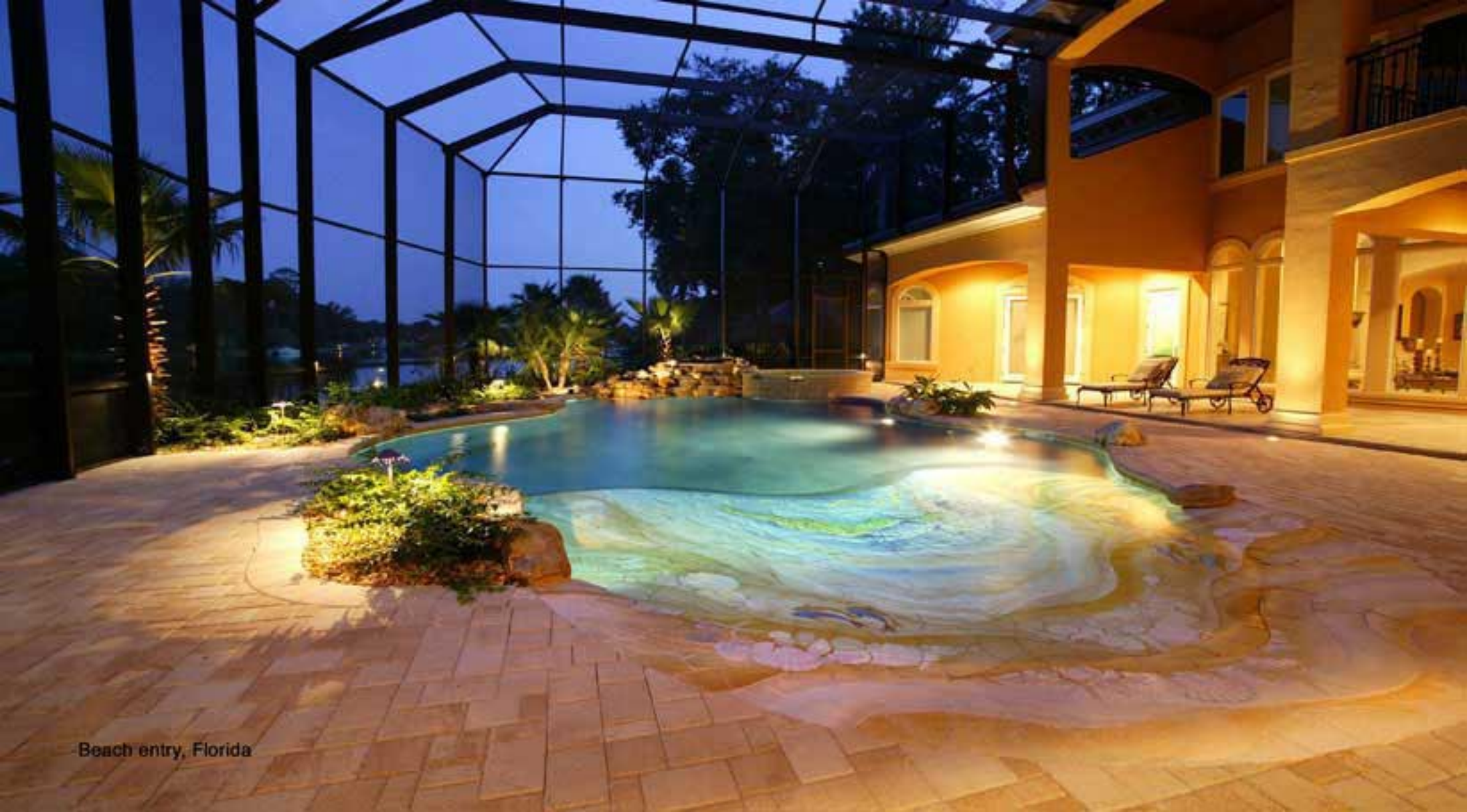
Beach entry, Florida