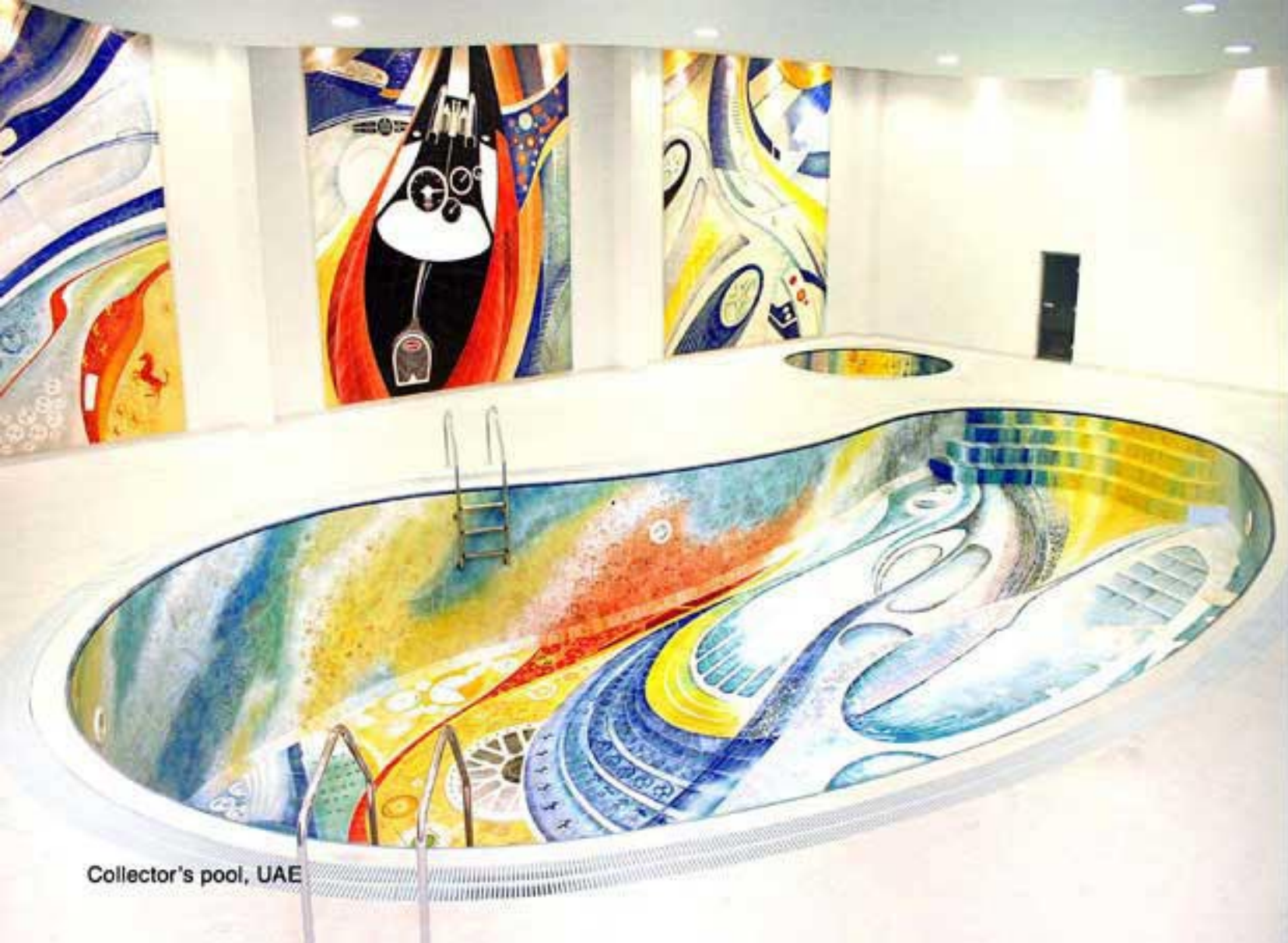
Collector's pool, UAE